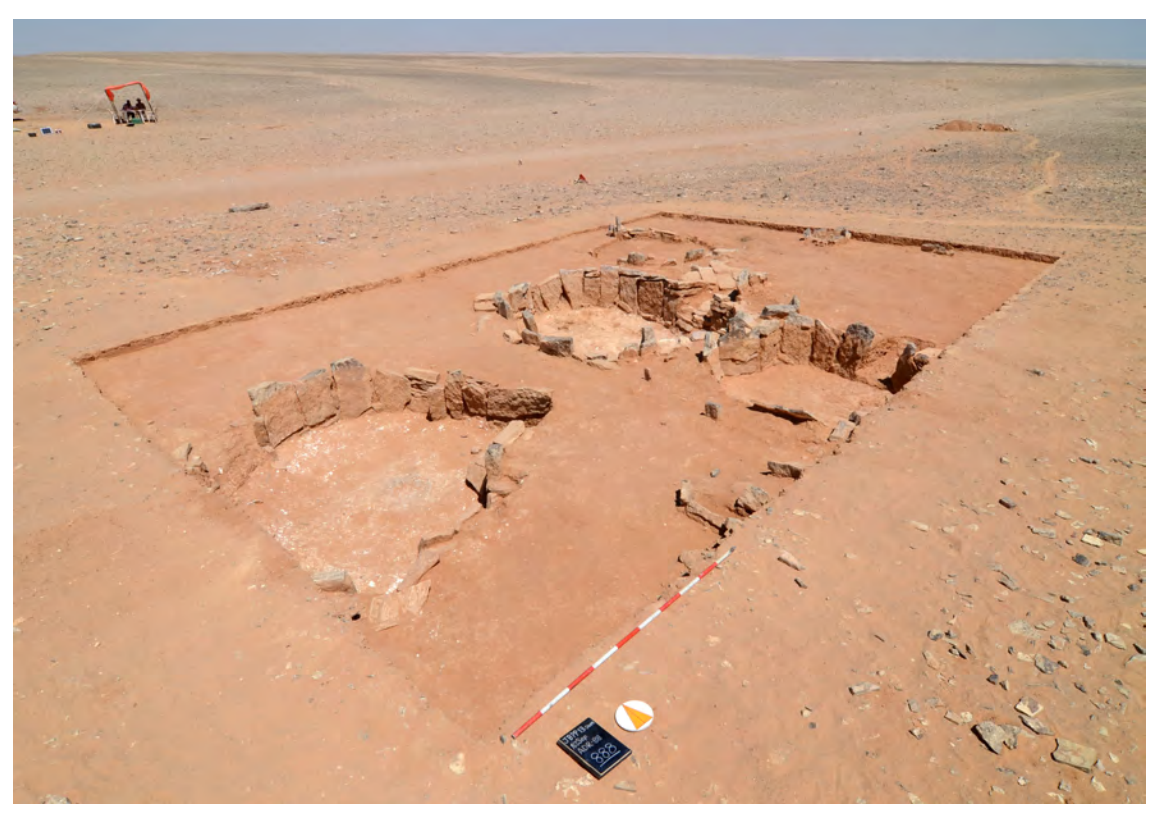
Fig. 4 Khashm al-'Arfa: general view (looking NE).