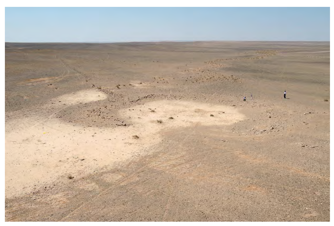
Fig. 2 BR-06: general view (looking NW).