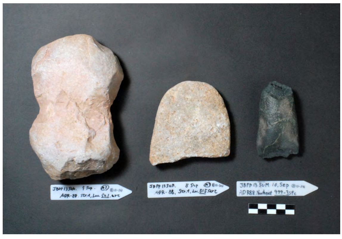
Fig. 7 Khashm al-'Arfa: groundstone artifacts.