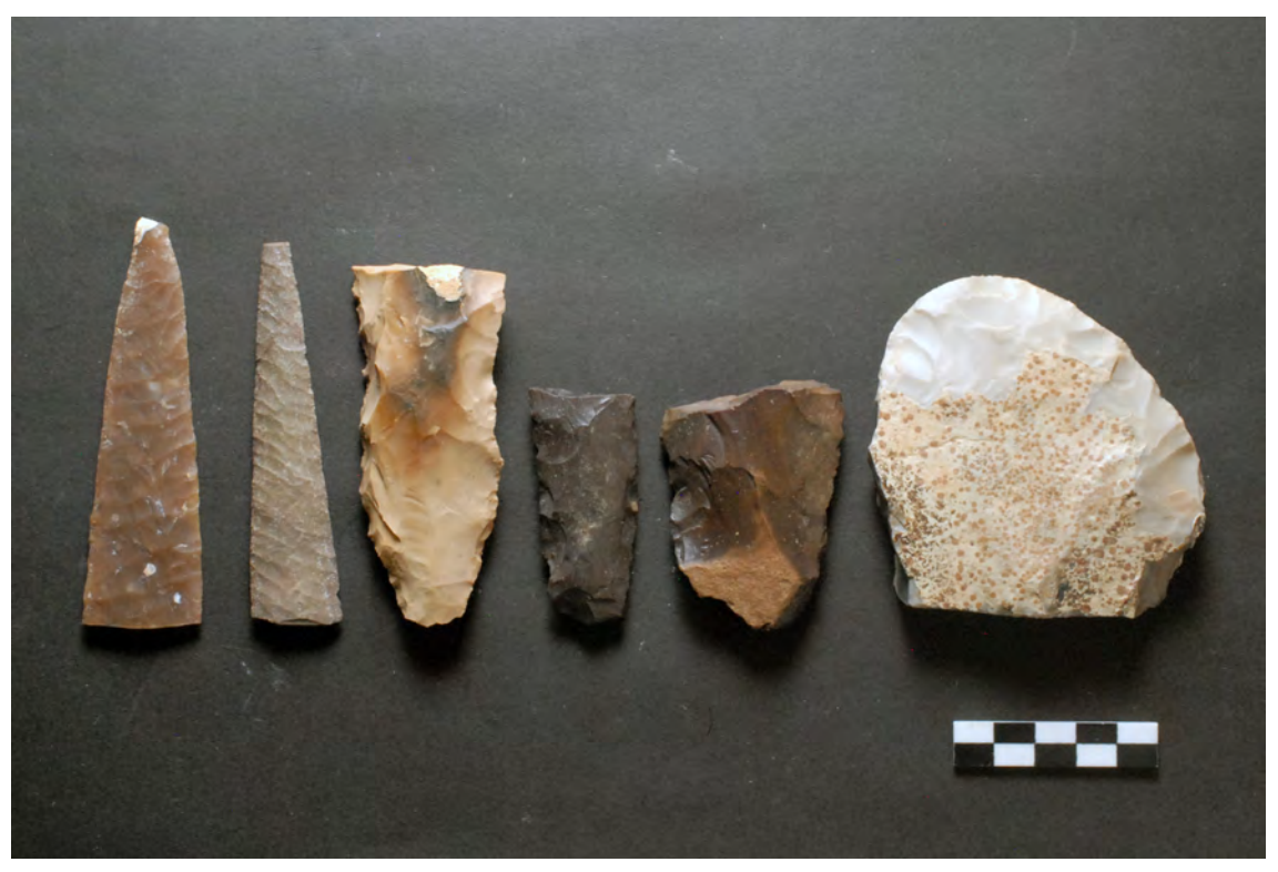
Fig. 6 Khashm al-'Arfa: flint artifacts (bifacial tools).