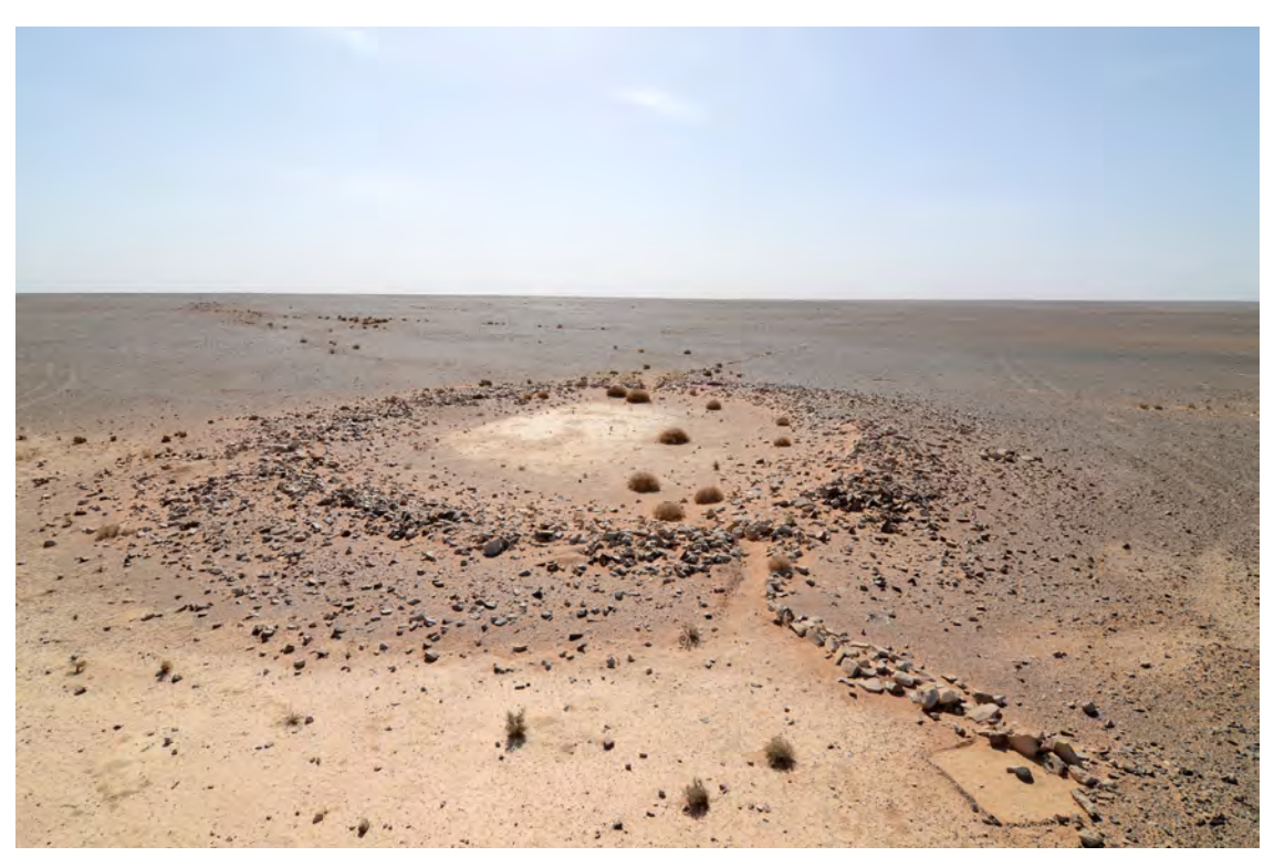
Fig. 3 BR-12: general view (looking N).