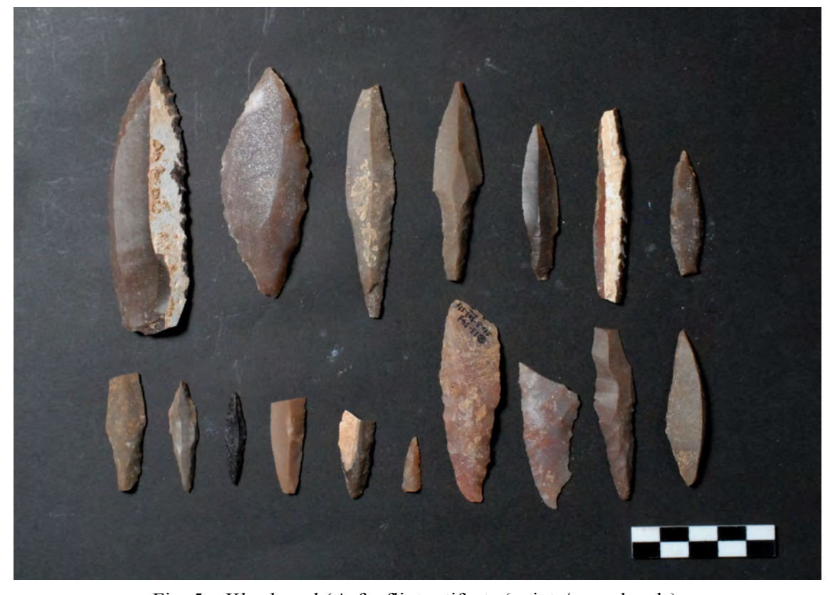
Fig. 5 Khashm al-'Arfa: flint artifacts (points/arrowheads).