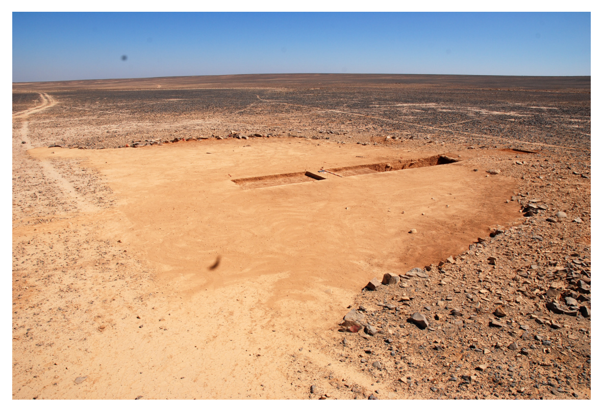
Fig. 4 Wadi Nadiya 2: general view of Barrage 3 (looking N).