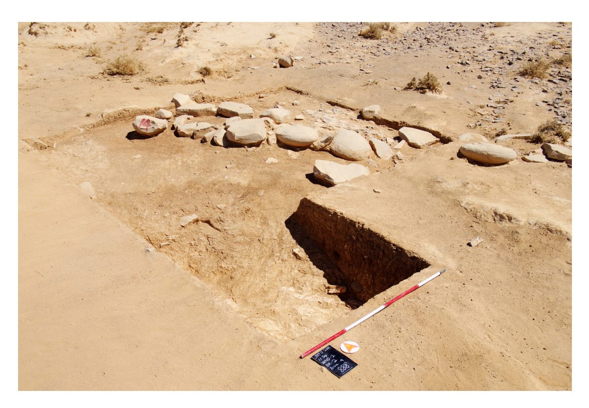
Fig. 3 Wadi Nadiya 2: close-up view of Area 4, Barrage 2 (looking E).