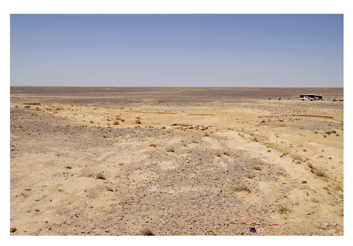
Fig. 2 Wadi Nadiya 2: general view of Barrage 2 (looking W).