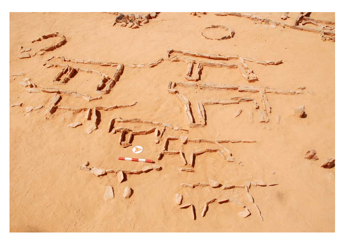
Fig. 5 Small features representing feline animals at 'Awja 1 (looking W).